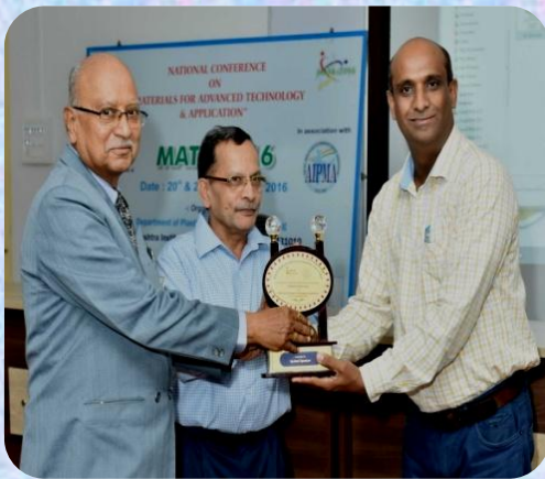
Welcome of invited speakers