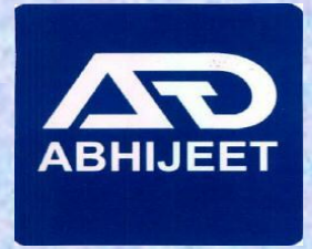
Abhijeet Tools and Dies, Mumbai