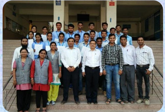
Workshop on "Fourier Transform Infrared Spectroscopy" held on 20 th – 25 th Feb 2017