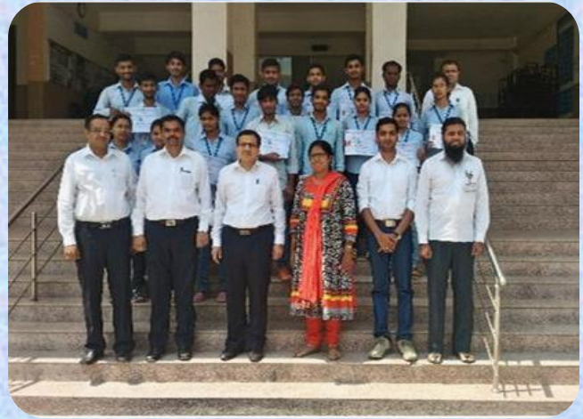
5 day workshop for students on "Plastics Product Design & Modelling using CAD"