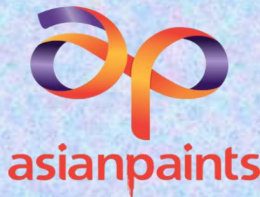
Asian Paint, Mumbai